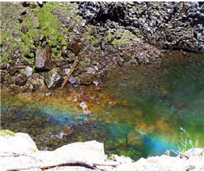
Rainbow at Rainbow Falls