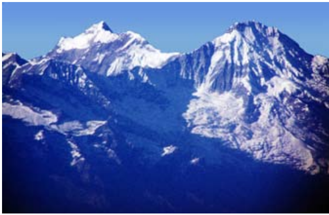
TREKKING IN NEPAL