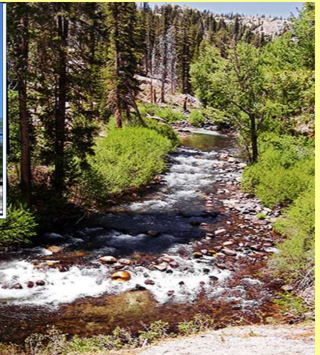
San Joaquin River near Mammoth Mtn