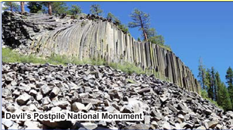
Devil's Postpile National Monument

Send news items, tripnotes, tales-of-the-trip, etc. to editor: rogervorst@att.net