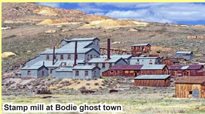
Stamp mill at Bodie ghost town