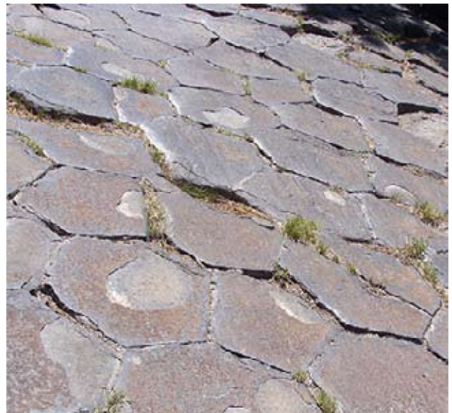
The top of Devil's Postpile