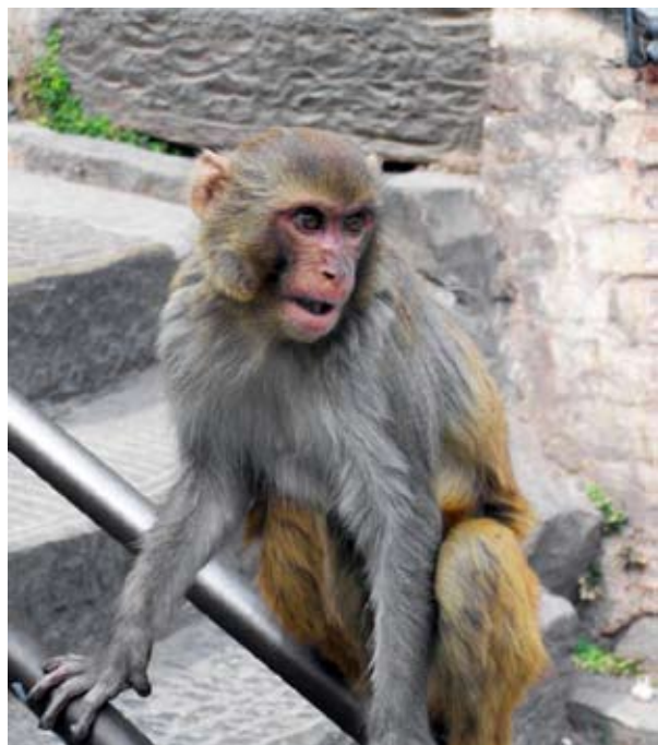
Images in and around Kathmandu, Nepal