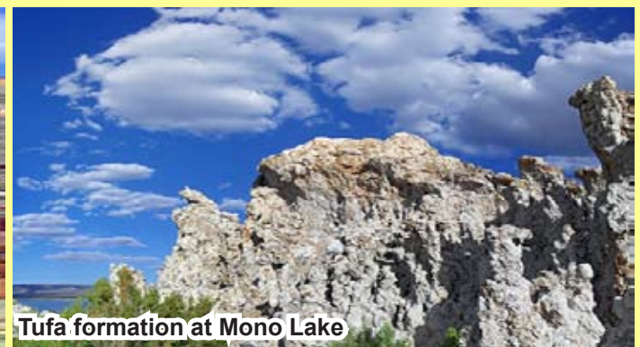
Tufa formation at Mono Lake

Membership runs annually from January to December