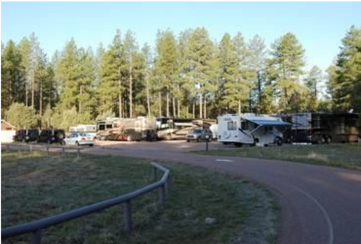
Campsite Layout For The May Sharp Creek Event