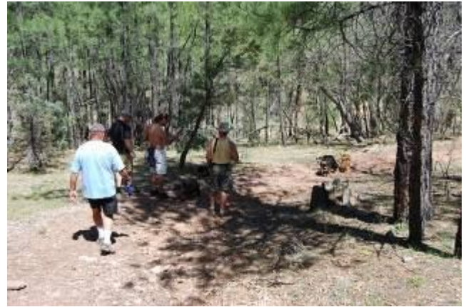
Hiking to Sharp Creek, May 2011